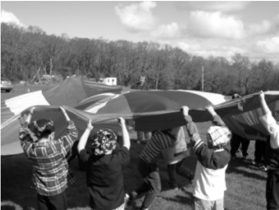
Somerset Battalion Anchor Fun Day 2005

OBJECT: The advancement of Christ's Kingdom among Boys and the promotion of habits of Obedience, Reverence, Discipline, Self Respect and all that tends towards a true Christian Manliness.