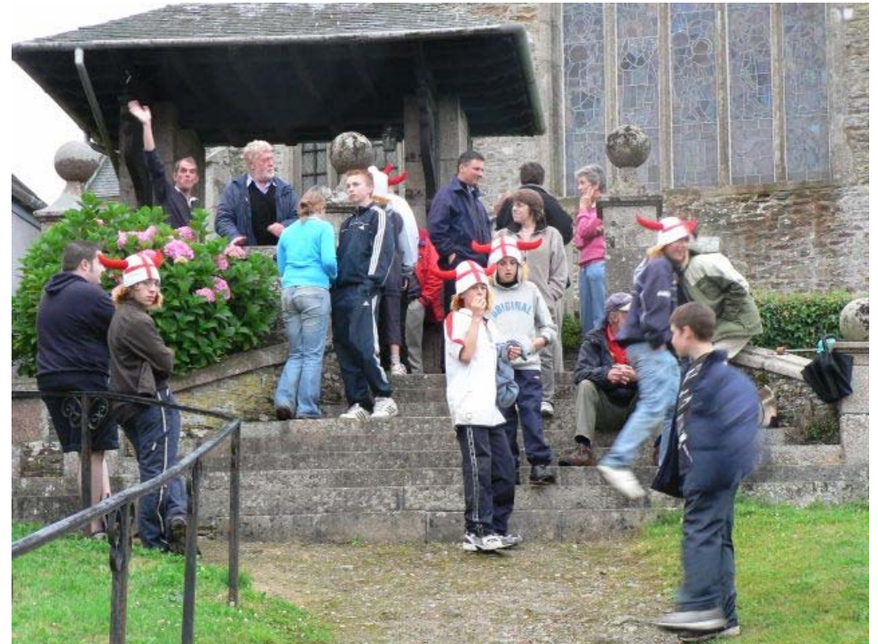
4 th Plymouth on Camp eating someone else's food (can anyone explain the hats?)

OBJECT: The advancement of Christ's Kingdom among Boys and the promotion of habits of Obedience, Reverence, Discipline, Self Respect and all that tends towards a true Christian Manliness.