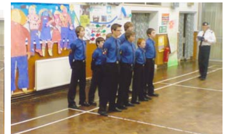
5 th Exeter awaiting the next move