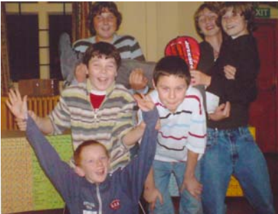
Table Tennis competition held at St. Thomas, Exeter

After a very successful summer camp held at Pembrey Country Park, Carmarthenshire in South Wales, it was back to normal. We met back on the second Thursday in September. In September we visited Haytor on Dartmoor for our camp, which was very good indeed. October was a quieter month for us with steady attendance. In November our first competition was the 5-a-side football and unihoc held at Exeter's Riverside Leisure Centre; we teamed up with the 1 st Exeter for this. Later in November we entered the