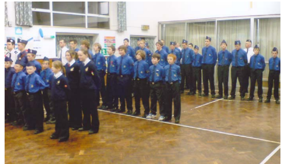
The squads at Devon Battalion Drill Competition

OBJECT: The advancement of Christ's Kingdom among Boys and the promotion of habits of Obedience, Reverence, Discipline, Self Respect and all that tends towards a true Christian Manliness.