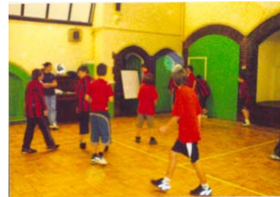
1 st Exeter (stripes) & 5 th Exeter (plain)